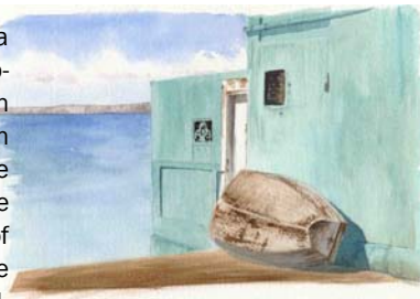
Towards Anguilla, Grand Case, St. Marten Watercolor 10"x6" 140 lb CP Arches

There are many more photographs I have taken on our journeys to St. Marten, Scot-