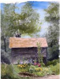
Summer on Ray Hill, Watercolor 12"x15" 140 lb CP Arches

This year I will have had 4 Open Studio events. On these days, besides talking to guests, I do a lot of painting! The first of such paintings was "Summer on Ray Hill" which was painted from a photograph I took last summer driving up Ray Hill on my way to Art on the Mountain. The owners of this small barn had lilies and other summer flowers growing in front of the structure. It pleased me a great deal